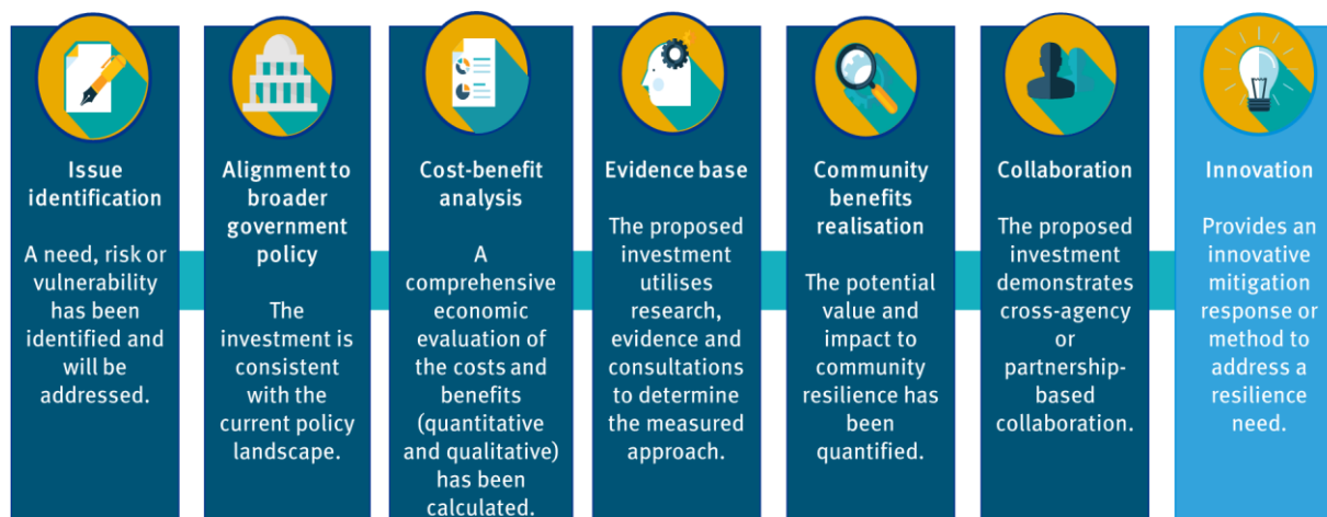
Figure 4. Key and additional considerations

Agencies are encouraged to consider how the six key and one additional consideration might be weighted within a specific funding program, in order to prioritise investments that support the intended outcomes of that funding stream.